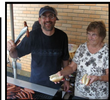
Hot Dog anyone?